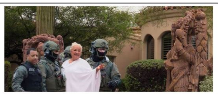
Above: Patton West's use of occult (hidden) knowledge has facilitated 30 years of theft, fraud, extortion and several suspected murders. The 'weapon' she uses to dispatch those who go public or oppose her is not regarded as a weapon under legal statute. Therefore the murders, which appear as deaths resulting from 'natural causes,' are not investigated.