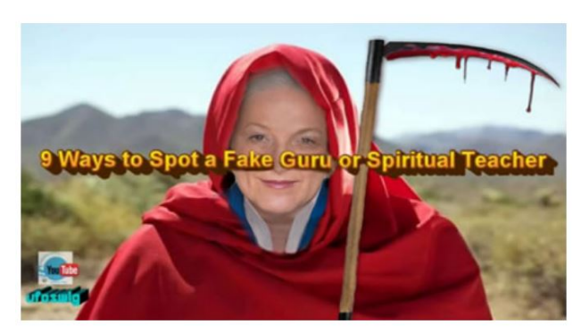
Nine ways to spot a fake guru.

You can help us by circulating these messages across your mailing lists and social media contacts.